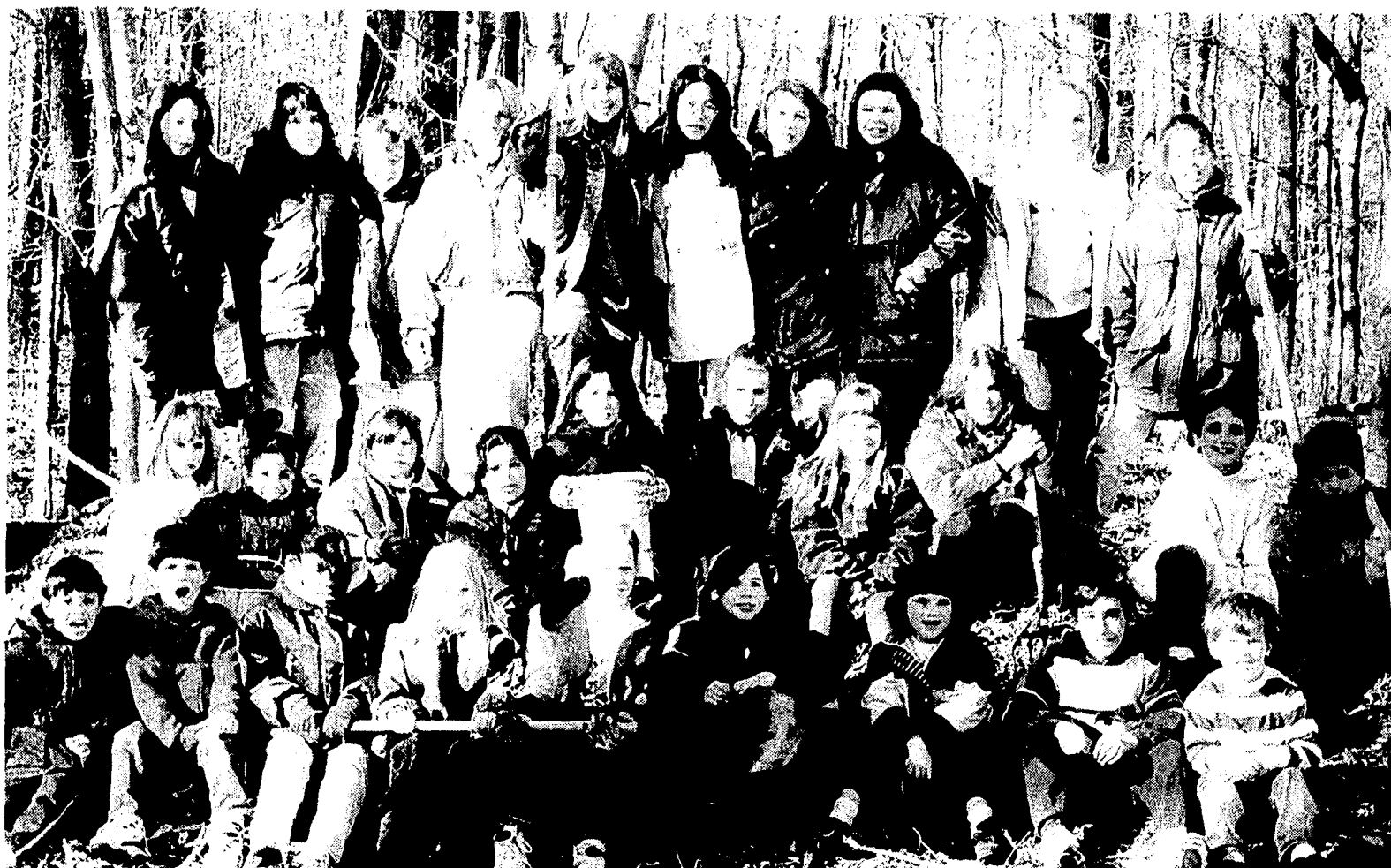
HAPPY TRAILS TO YOU... Brookside Park in Scotch Plains just got a new trail to the north of the playground equipment running to the Winding Brook, a tributary of the Robinson's Branch of the Rahway River. This trail is part of an extensive upgrade of the park. The new trail will eventually hook up to an existing nature trail that runs the length of the brook on the eastern side of the park which borders on Memorial Park in Westfield. Two bridges crossing the brook will create a circuit for joggers and will provide much-needed crossing spots for Scotch Plains residents which will, in turn, help to curb stream bank erosion. On April 9 and 10 over 85 Girl and Boy Scouts and their leaders and some parents all chipped in to create the first half of a new woodland trail at Brookside Park. The girls from Junior Troop No. 96 laid logs to edge the trail while Daisy Troop Nos. 579, 935, 341 and 877 and Brownie Troop Nos. 342 and 52, and Coles School Cub Scout Den Nos. 1, 7 and 9 laid the wood chip trail. Cadettes from Troop Nos. 1 and 751 and Seniors from Troop No. 561 helped the younger girls and boys with their tasks. Two Boy Scouts: Michael Anderson and Stewart Slauch assisted by sawing and clearing the path for the trail to come through. Over a quarter mile, approximately half of the trail, was laid in the two days by the Scouts. Plans are under way for the completion of the trail. This project was organized by Marcia Anderson, a local landscape designer and Scout leader, with the support of the Scotch Plains Departments of Parks and Recreation, Public Works and the Environmental Commission. Pictured is a group of Girl Scouts and Cub Scouts from Scotch Plains and Fanwood resting after a long afternoon of trail building at Brookside Park.