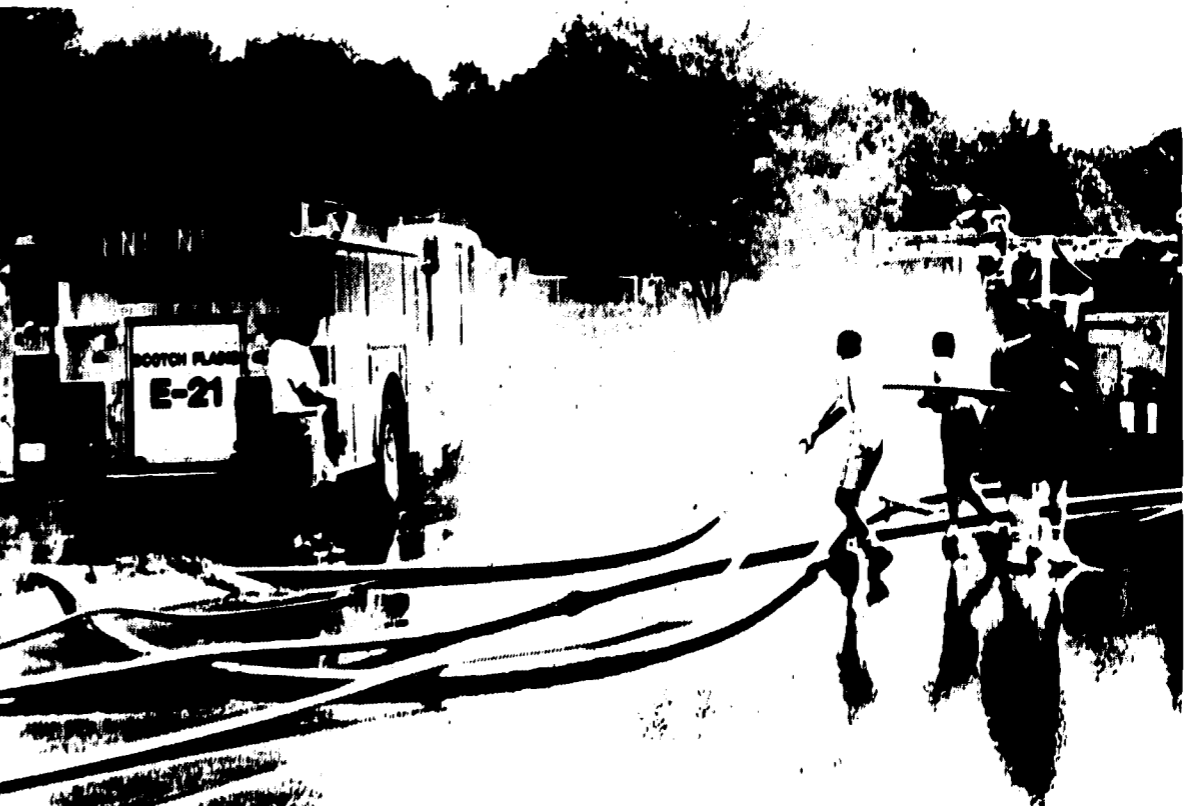
SPLASHY DEBUT... The Scotch Plains Fire Department helped visitors keep cool last Saturday during their "Task Force Wet Down" to christen their two brand new Pierce 1,500 GMP pumps, along with the department's newly refurbished 75-foot tower ladder. The event, which also featured refreshments, games and souvenirs for visitors, was held at the fire house at the corner of Martine Avenue and Raritan Road.

"I have been very fortunate in that everyone I have worked with, whether they are paid staff or parent volunteers, have been wonderful," she com-