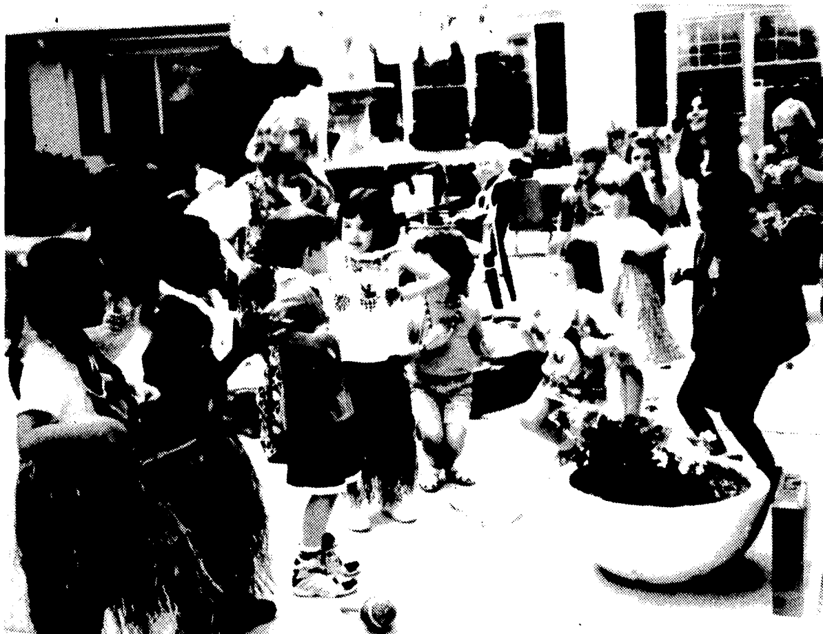
DANCING THE HULA... Evangel Day School Kindergartners practice their Hula and Chicken Dancing for residents and staff of Ashbrook Nursing and Rehabilitation Center during a recent Hawaiian luau summer picnic. The children enjoyed hot dogs and hamburgers supplied by Ashbrook's Dietary Department and entertainment by D & E Karaoke. Ashbrook, located in Scotch Plains, is an affiliate of the Saint Barnabas Health Care System.