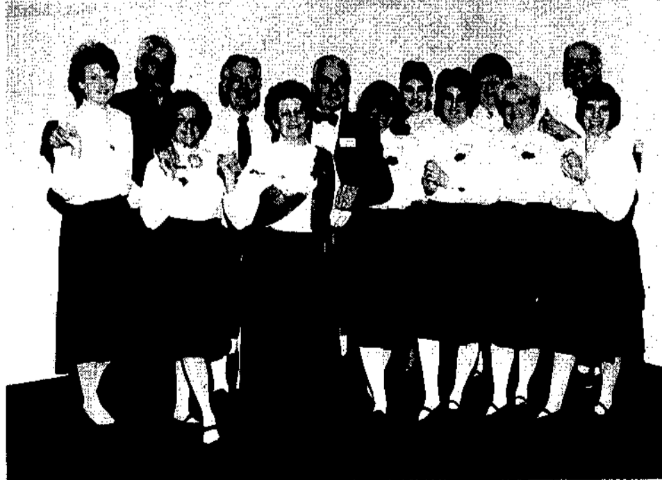
SHOWING THE SPIRIT... Members of the Fanwood Flyers, a Scottish dancing group, entertain during last weekend's Scottish Night at the Fanwood Presbyterian Church in the borough.