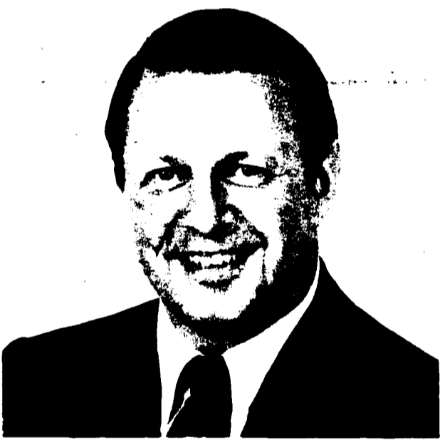
ASSEMBLYMAN ALAN AUGUSTINE

Augustine was mayor of Scotch Plains in 1979 and Please turn to page 11