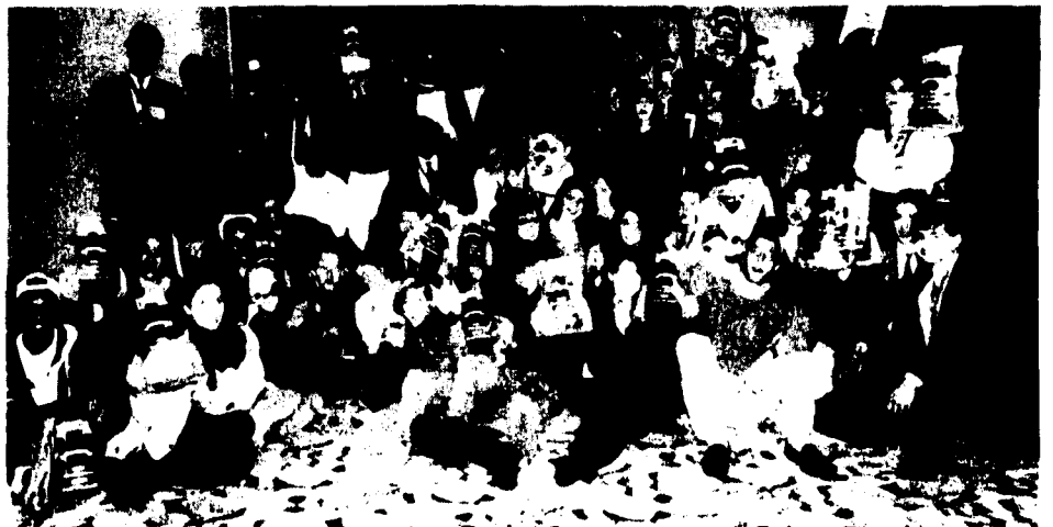
DECA students displays awards at competition.

The Scotch Plains-Fanwood High School DECA Chapter, an Association of Marketing students, has in its 22 years of existence had a tradition of winning many awards in statewide and national competitions in