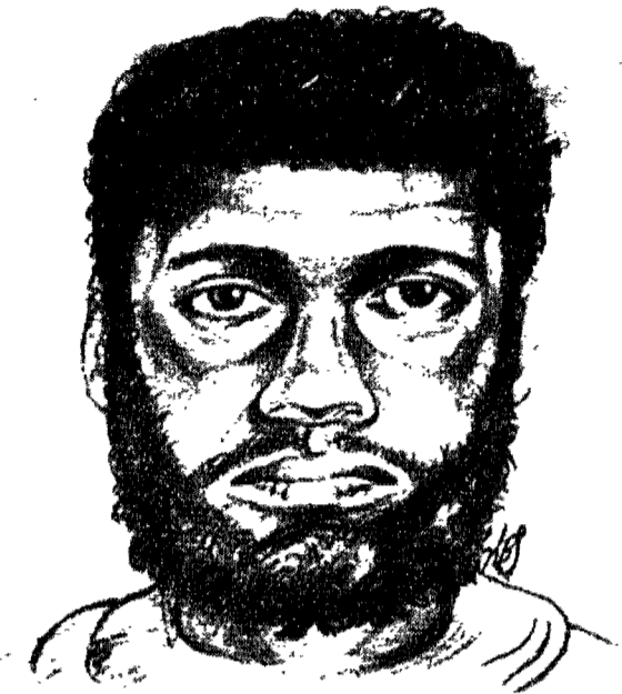
State police have released this sketch of a defendant wanted in connection with the November 27th burglary and assault in Scotch Plains.

Persons who do not want to give their name can also call the Crimestoppers tip line, 654-TIPS, to give information. Please turn to page 2