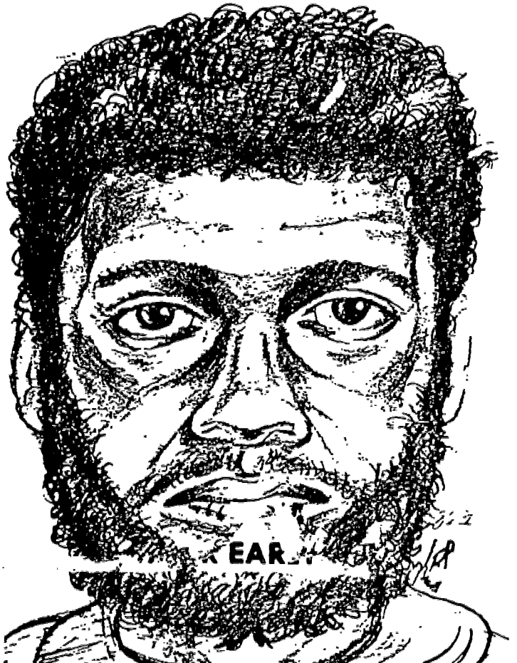
Have you seen this man?