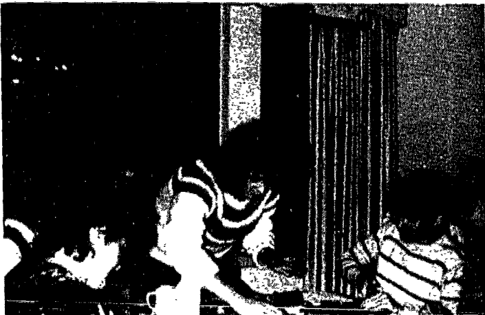
SP-F Newcomer's Club members creating holiday ornaments for their annual "Donuts with Santa".

The Scotch Plains-Fanwood Newcomer's Club will host its ninth annual "Donuts With Santa" on Saturday, December 13th at the All Saints Episcopal Church, 559 Park Avenue, Scotch Plains.