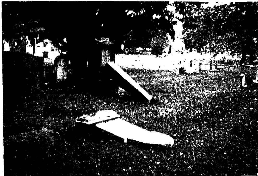
Vandalism of this sort constitutes destruction of Scotch Plains' history.

They are appealing to the citizens of Scotch Plains to share an information they may have. Of course, this will all be kept confidential. Anyone with any information should contact the Scotch Plains Detective Bureau.