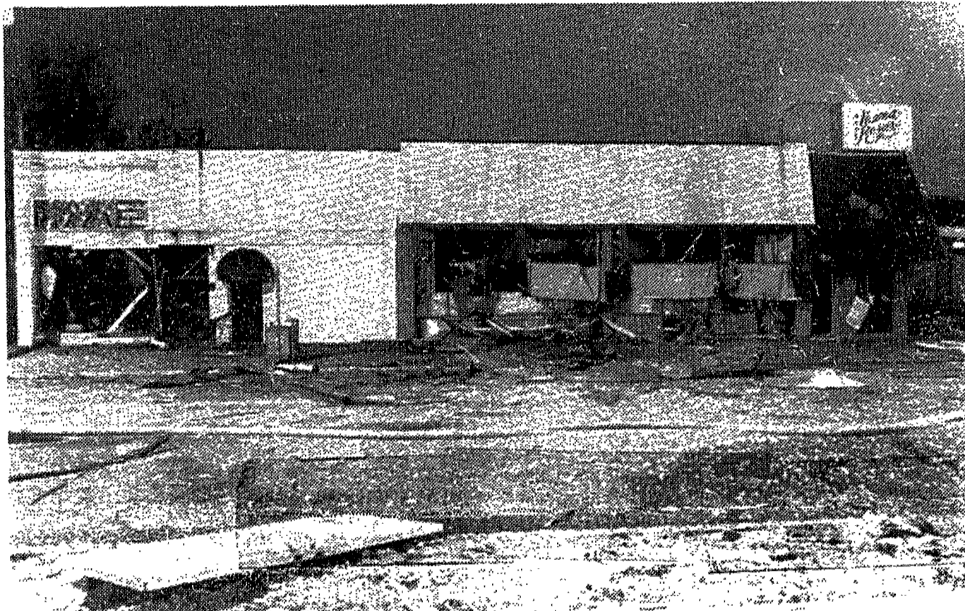
The awful aftermath of the explosion at Mama Rosa's Restaurant.