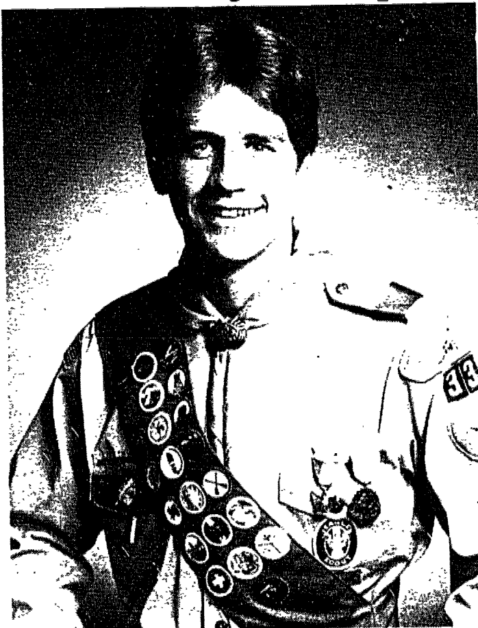
On Monday evening, June 13, Boy Scout Troop 33 of Fanwood

convened an Eagle Scout Court of Honor at