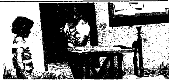
Greenside's activities, including carom pool, last week.