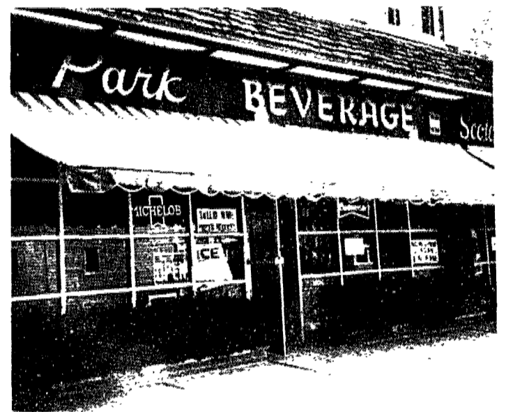
From the beginning...

The group found that in some cases, parents of a deceased worker are eligible. Please turn to page 3