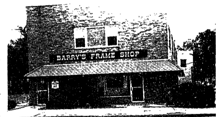
turn the corner...