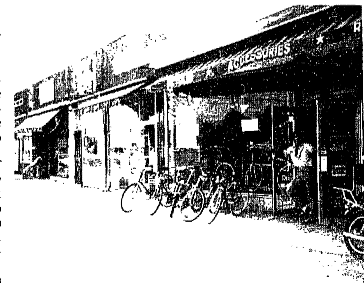
all the way down East Second Street to fine your Summer Sales.