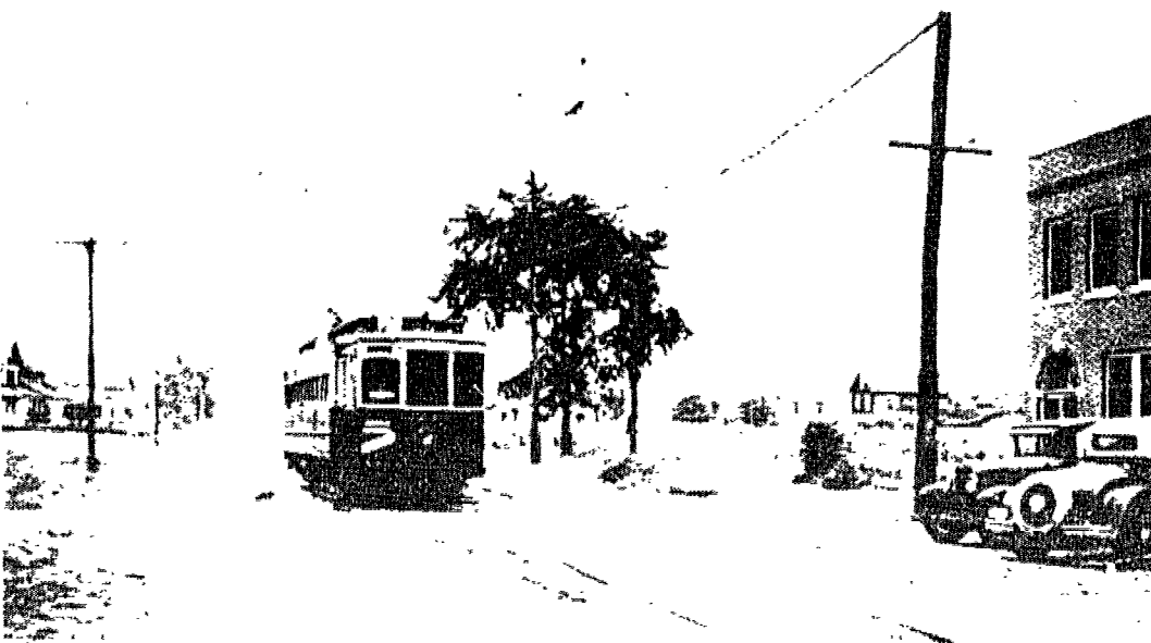
On Sept. 14, 1935, the last trolley ran in Scotch Plains. Picture shows trolley on its route, known as Union Line 2249. On the left was the baseball field and on the right a cornfield where the post office was later located. View is looking west from the corner of Park Avenue and Second Street.