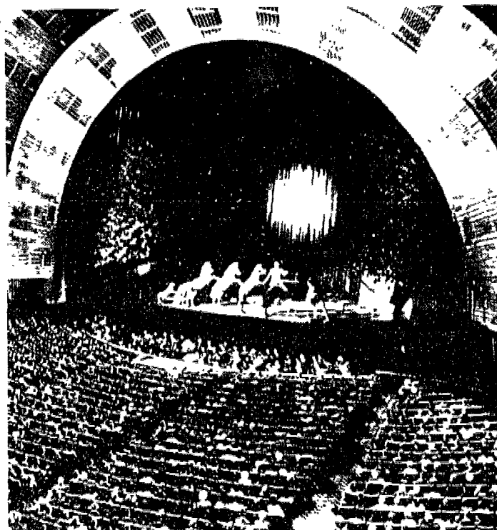
Christmas show at Music Hall.

The AFS International weekend was held from March 11-15. The weekend brought 27 students from 24 countries to Scotch Plains-Fanwood for four days. These students lived in the homes of Scotch Plains-Fanwood High School students for the four-day period. The students were involved in an assembly held