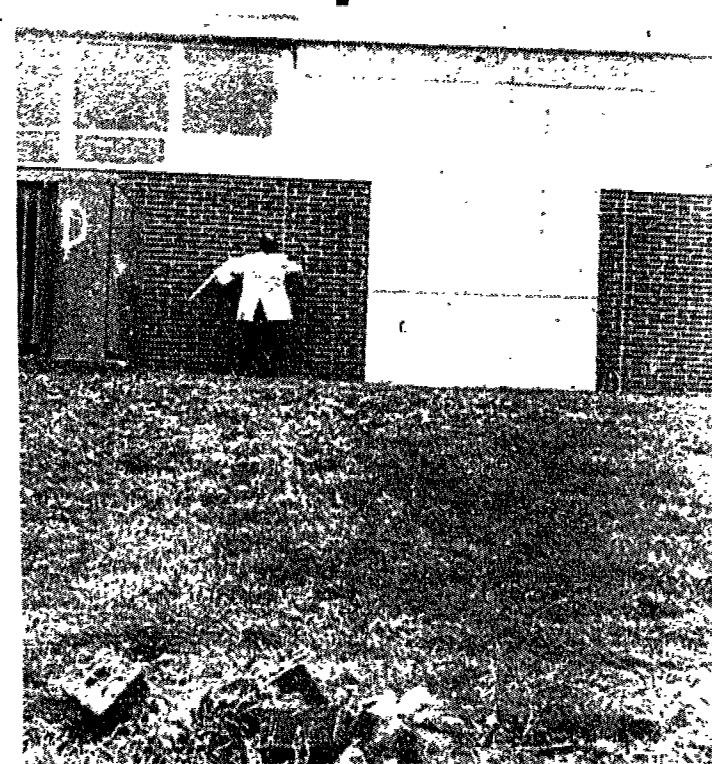
An insurance adjuster measures damage areas at the rear of Terrill Junior High, following an explosion and fire early Saturday morning. Plywood covers areas of structural damage to bottom portion of wall, and to high windows. Bricks in foreground were tossed from the wall to this location by force of blast.