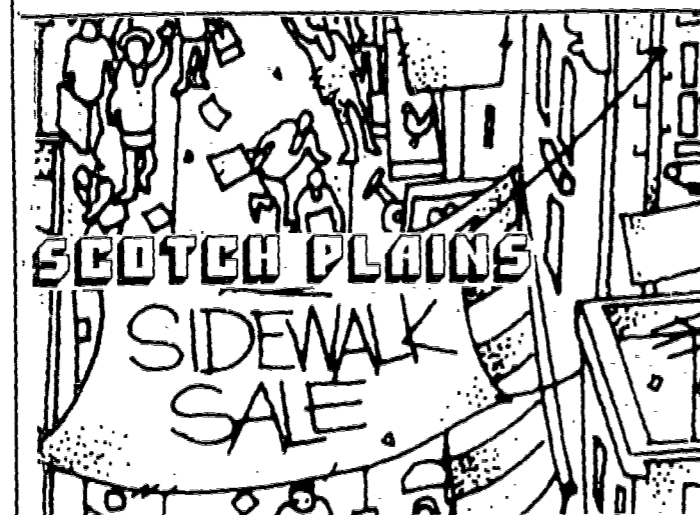
See page 11

SCOTCHPLAINS LIBRARY 1927 BARTLE AVE SCOTCH PLAINS, NJ 07076