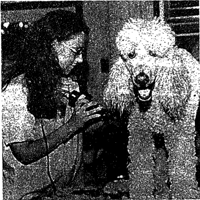
"I KNOW I REQUESTED A LITTLE LONG ON THE SIDES...BUT REALLY!!!"