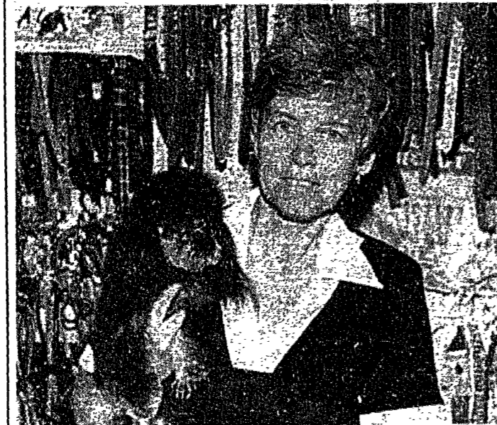
I'M ALL READY NOW, MOM, COME GET ME!