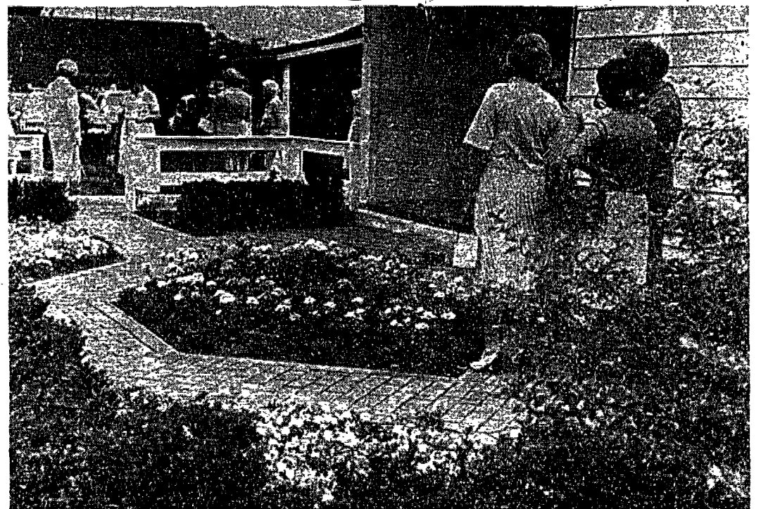
Strollers admire new geometric garden at Scotch Plains Village Green.

Behind the fenced garden is a second garden, with divided planting sections featuring beautiful examples of Colonial horticulture. The