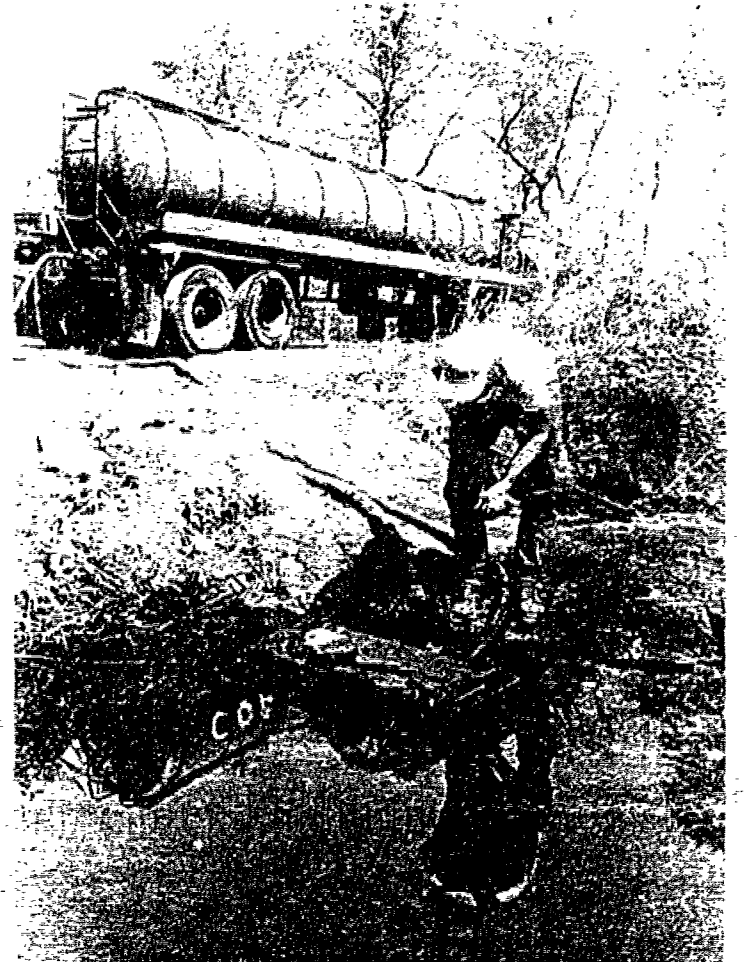
A workman pumps oil slicks from a Scotch Plains brook.