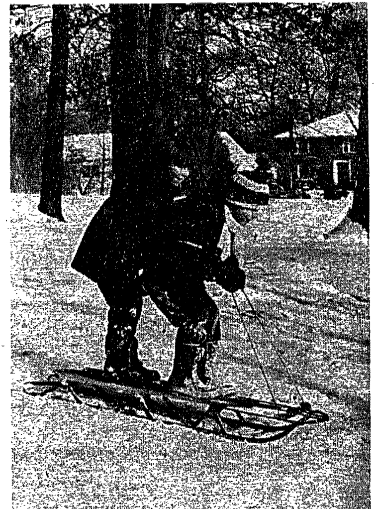
Combine a holiday from school and snow on the ground. It spells fun for kids. Here, two daredevils test their skills on a hill at Elm Avenue in Fanwood.