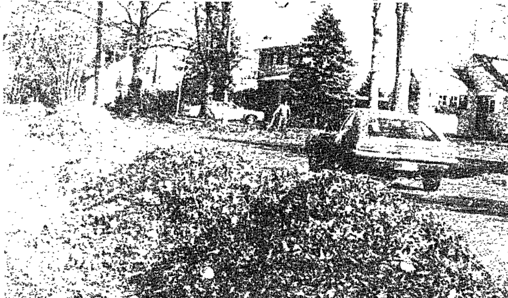
The autumn leaves have fallen, but they're still in our midst. This scene on Shackamaxon Drive, Scotch Plains offers a clue to the problems still facing Public Works crews in Scotch Plains-Fanwood.

DUE TO THANKSGIVING WE WILL HAVE AN EARLY CLOSING DEADLINE... COPY DUE FRIDAY, NOVEMBER 25 — NOON.