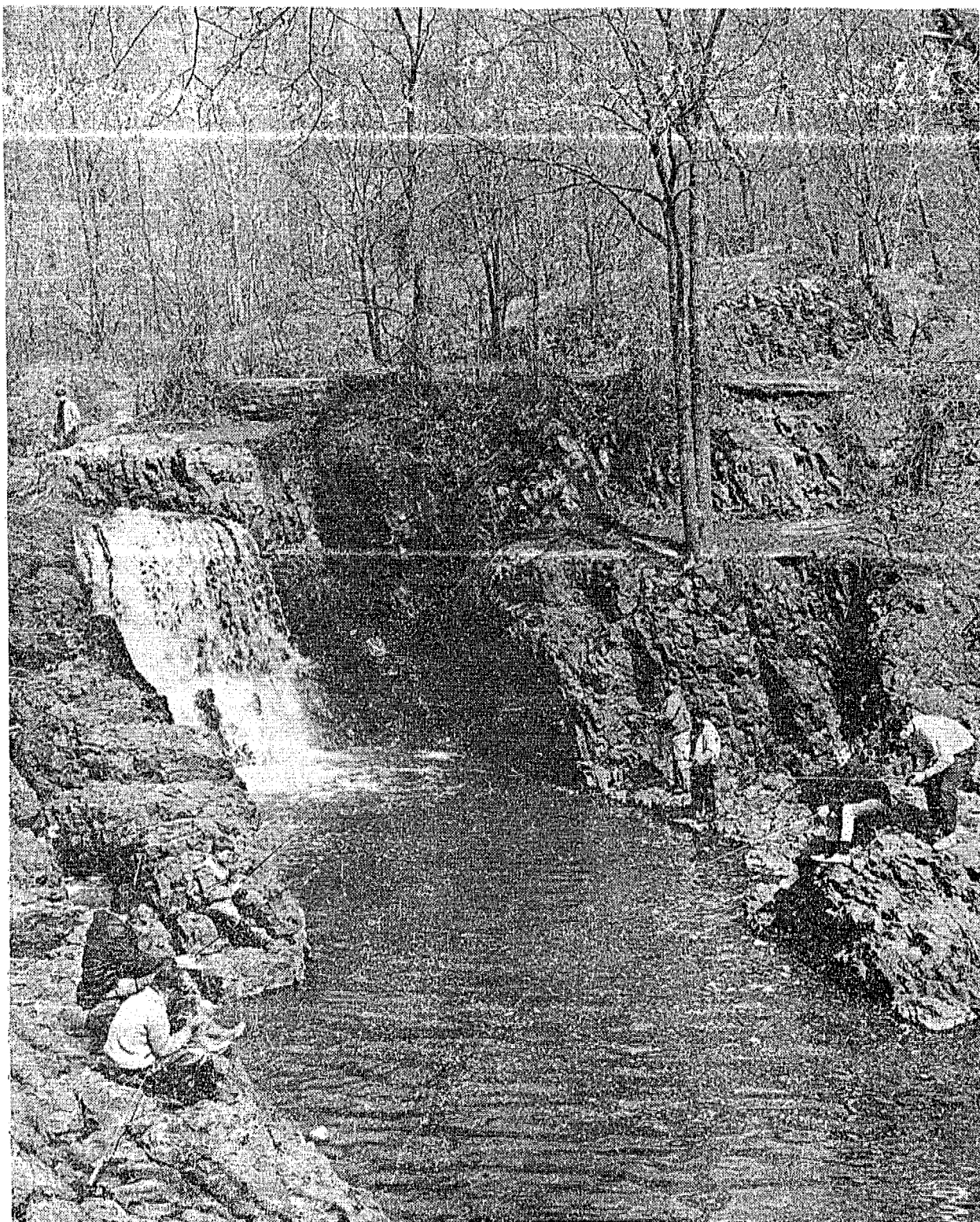
The early bird catches the worm, but not so when Trout Season opens. A few of the devoted enthusiasts are pictured at their favorite haunt at Green Brook, Scotch Plains as Trout Season officially opened Saturday April 8.