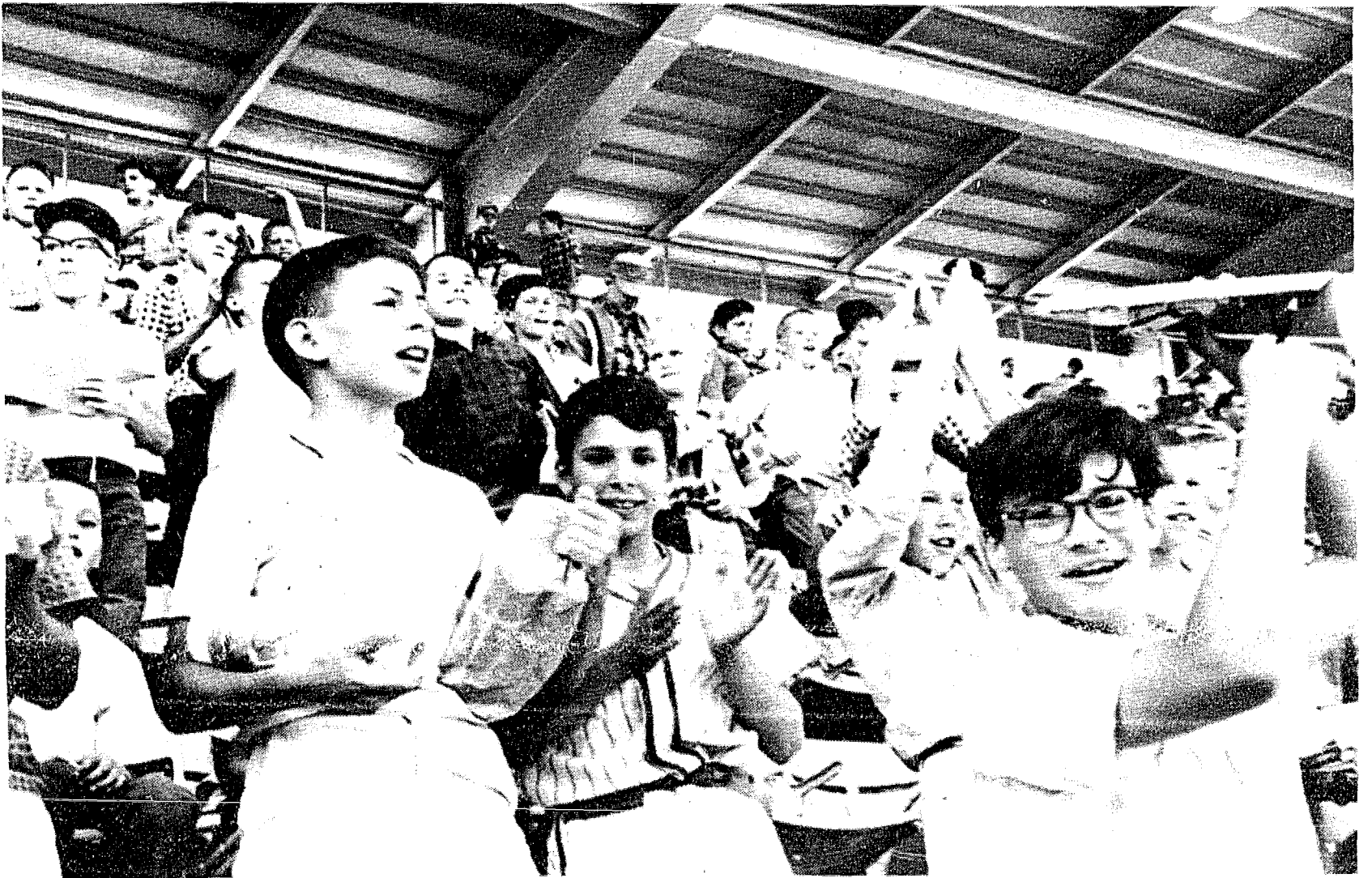
And the stands rang with the Happy Cheers of the Scotch Plains Minor, Midget and Junior League Players.

This was the first such trip sponsored by the Recreation Commission for the members of the baseball program and it was thoroughly enjoyed by all.