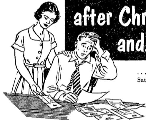
... in the front room, Sat Mother and Father the picture of gloom.

Last year at this time, Father had said, Let's skip Christmas Club, Save our own way instead.